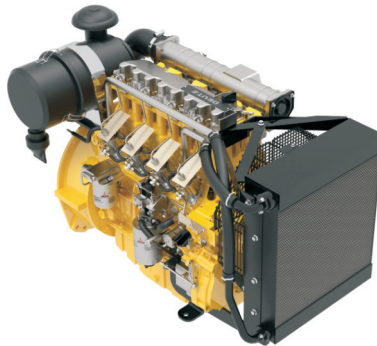
The DEUTZ Telco Engine